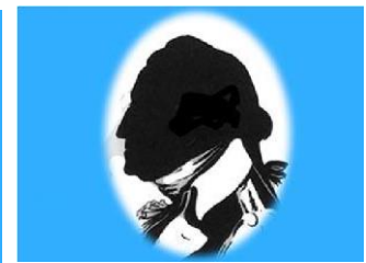
Jr. Steward TBD