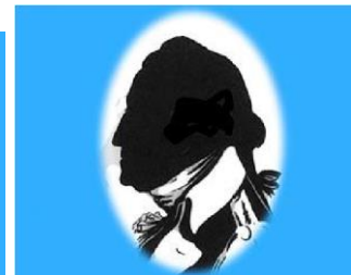
Jr. Steward TBD