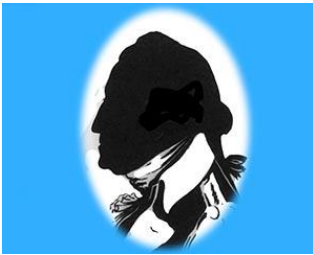
Jr. Steward TBD