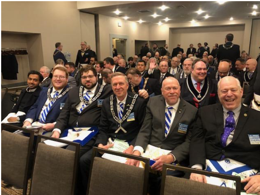
Picture was taken of some of the brothers from Cosmopolitan. before the session started.