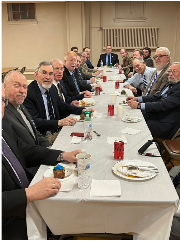
FELLOWSHIP DINNER IN JANUARY