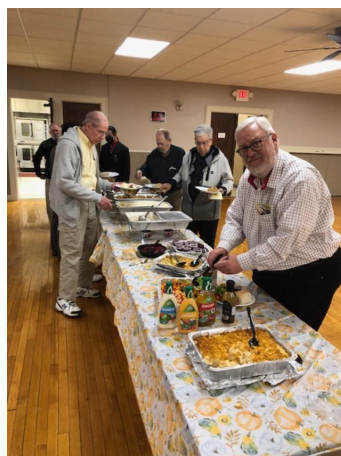
Brothers of the Craft