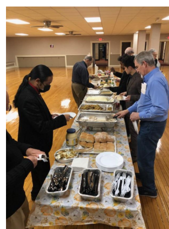
Brothers of the Craft