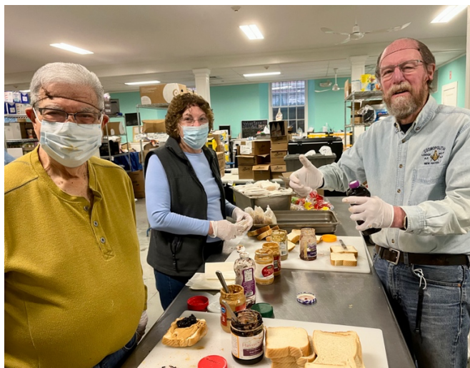
DESK – Food Preparation