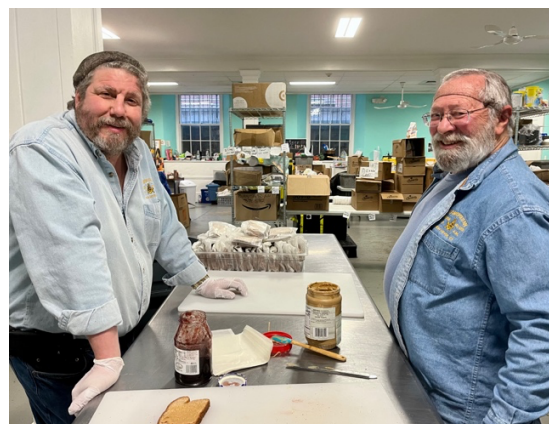
DESK – Food Preparation