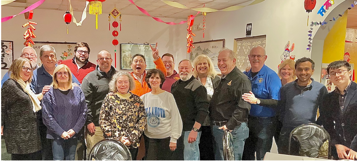
Group Picture at the Fellowship Dinner at the Panda House Restaurant