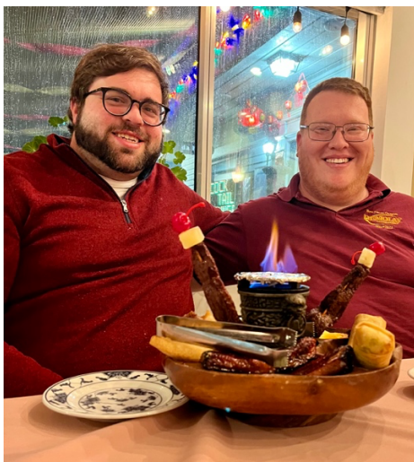
Great Food at the Panda House