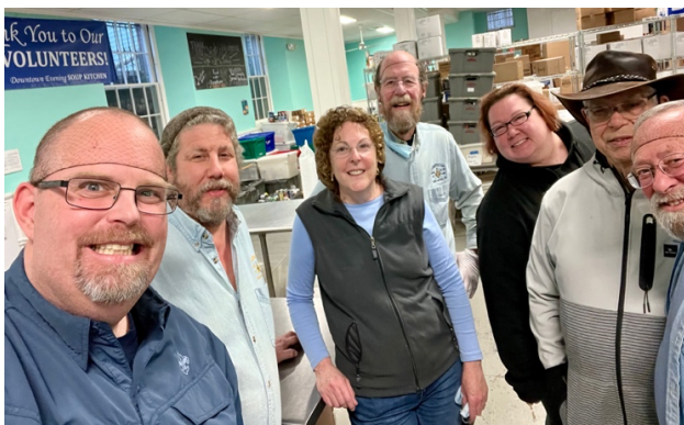
DESK – Group Picture