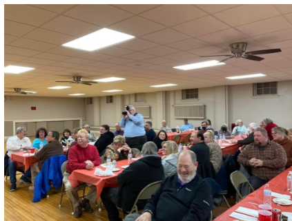
Wonderful Dinner for over 60 brothers & their families.