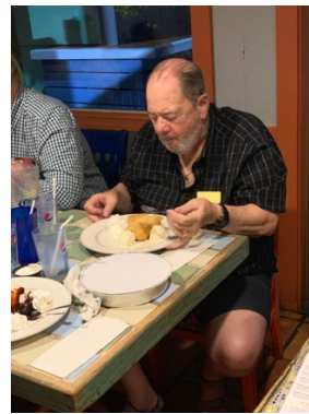
Isn't Dessert Wonderful

Every Month Cosmopolitan Lodge #125 on the 4 th Wednesday goes to a different restaurant for good fellowship with members of our lodge and their ladies. We have opened this event to other lodges and any perspective members who would like to see and enjoy the camaraderie that our lodge has become to know us by.