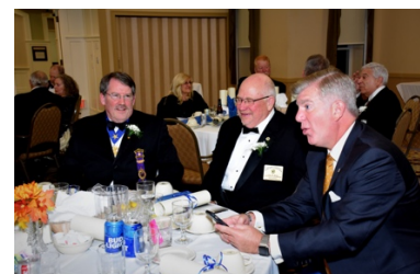
Masonicare & GL Dignitaries