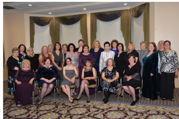
These are the wonderful Ladies who make it all possible to do the things in Masonry that we all love to do!