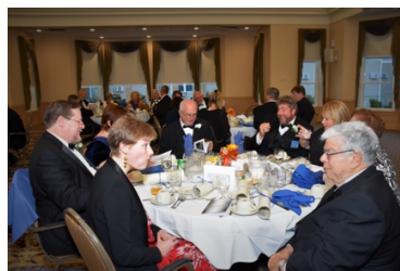
Grand Master's Table