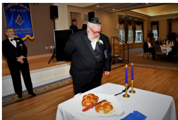
Sheh-heh-cheh-ya-nu Prayer "Prayer for Thanksgiving"