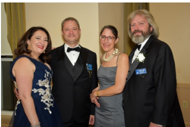
Berger's & Morse's