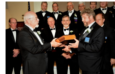
Presentation of new Bible to Master