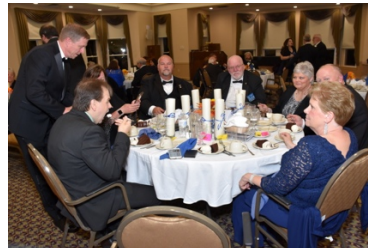
Some of the Newest Master Masons