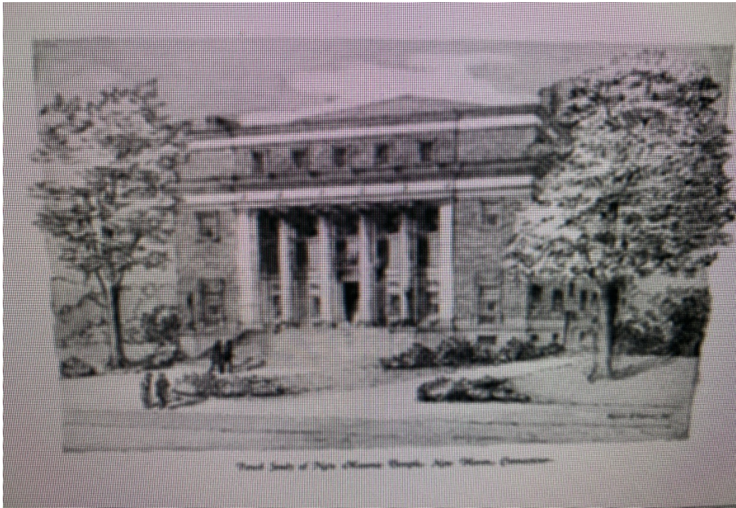
1926 Picture of our Masonic Building Here we have 11 entities that support this building Hopefully for many years to come