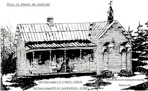
This is where we started

NON-PROFIT ORG. U.S. POSTAGE PAID OXFORD, NC 27565 PERMIT NO. 56