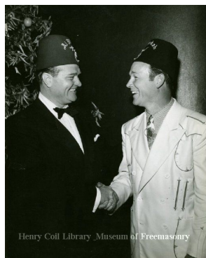
Henry Coll Library Museum of Freemasonry