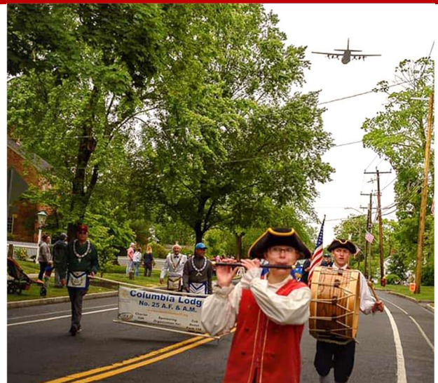
At the Glastonbury Memorial Day Parade (Photo from 2021 Parade)