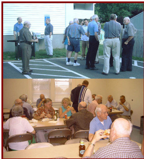
The Lodge was cooking outside and in at Barbecue on June 15, 2004