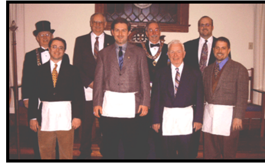
St. Patrick's Day Master Mason Degree Four New Master Masons and their Mentors