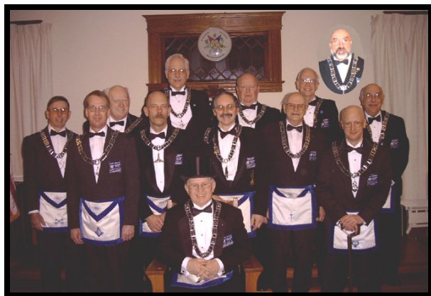
2004 Lodge Officers