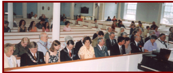
Saints Johns Sunday - June 19, 2005

"Walk with me and work with me — watch how I do it. Learn the unforced rhythms of grace. I won't lay anything heavy or ill-fitting on you. Keep company with me and you'll learn to live freely and lightly."