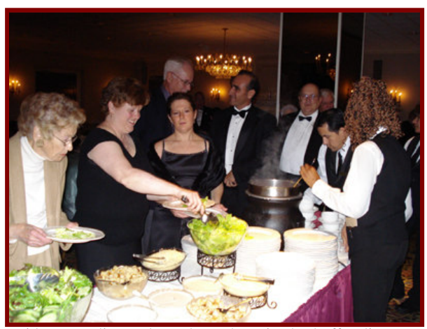
Widows, Ladies and Brothers share in the buffet dinner as part of the festivities of Ladies Night in the Grand Ballroom of the Hartford Club on Friday evening, October 12, 2007.