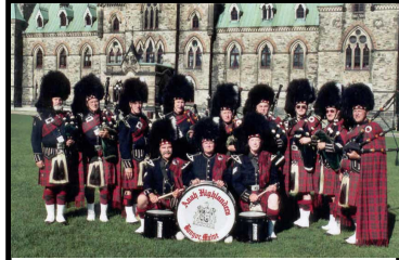
The Anah Highlander Degree Team marches to the beat of a different drummer

The BIG event for this spring will be held on Saturday, May