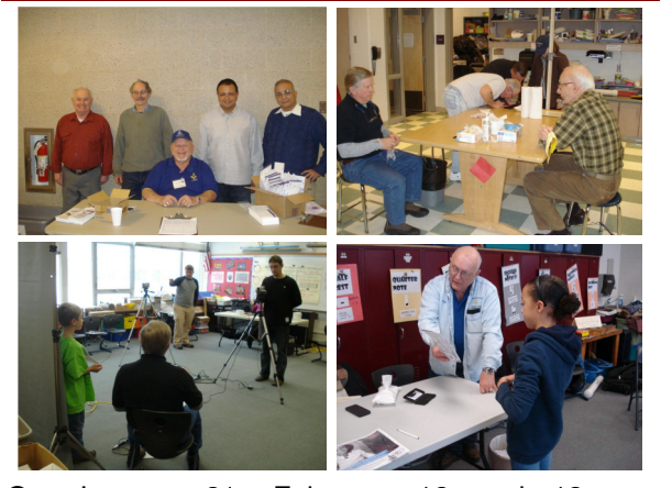
On January 21, February 12 and 13, we conducted CTCHIP events at Cub Scout Pack 158's, 356's and 180's Pinewood Derbies at Hebron Avenue and Navuag Schools.

Connecticut Child Identification Program