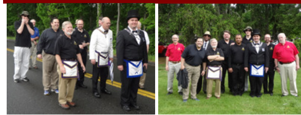
Twelve craftsmen from Columbia Lodge No. 25 A.F. & A.M. marched in the parade.