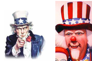
Uncle Sam Wants You!