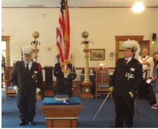
Washington Commandry No. 1