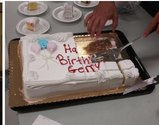
A 90 th birthday Celebration