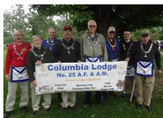
Columbia Lodge brothers after marching in the Glastonbury Memorial Day Parade May 26, 2018.